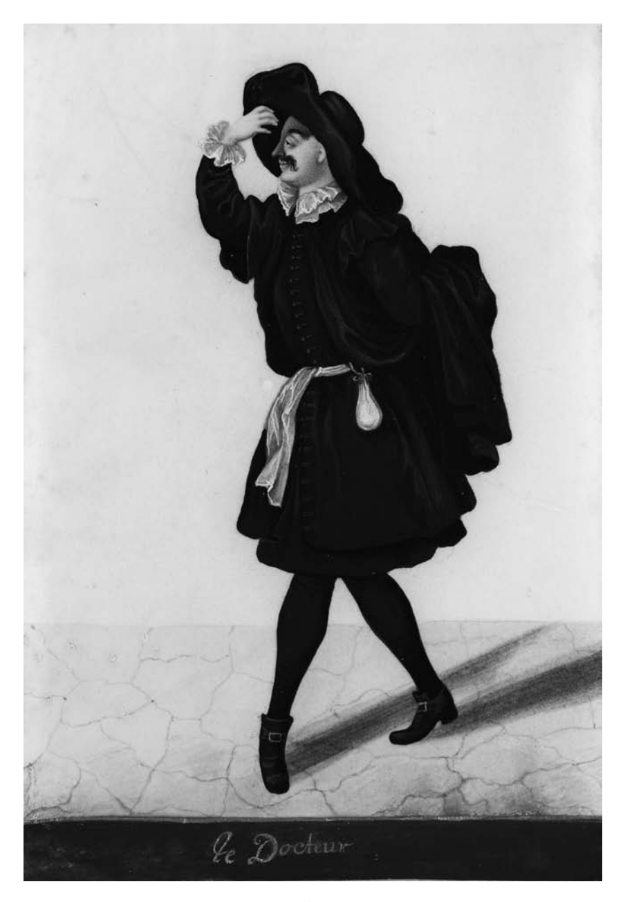
Fig. 3. Le Docteur (Collezione del Castello di Český Krumlov).