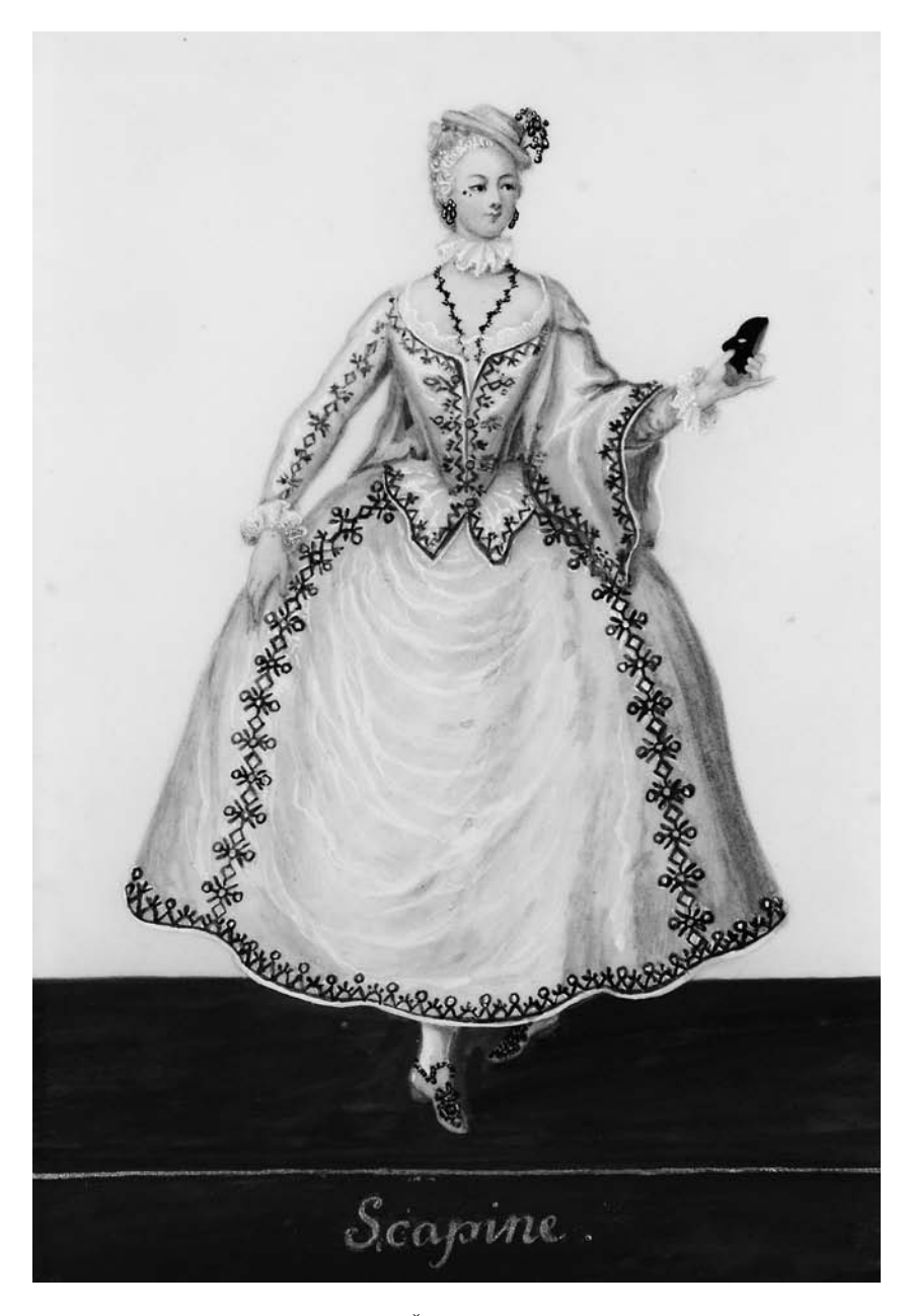
Fig. 9. Scapine (Collezione del Castello di Český Krumlov).