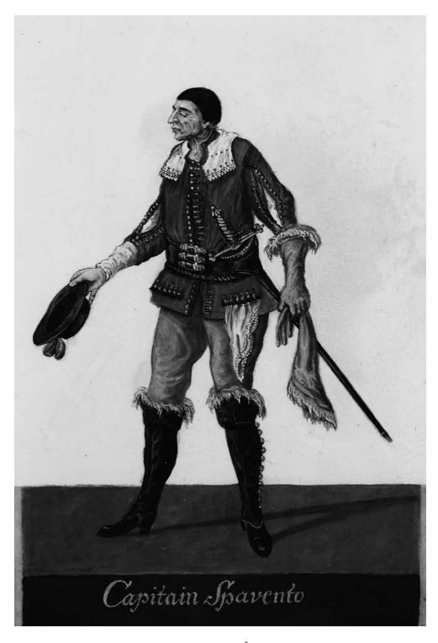
Fig. 5. Capitain Spavento (Collezione del Castello di Český Krumlov).