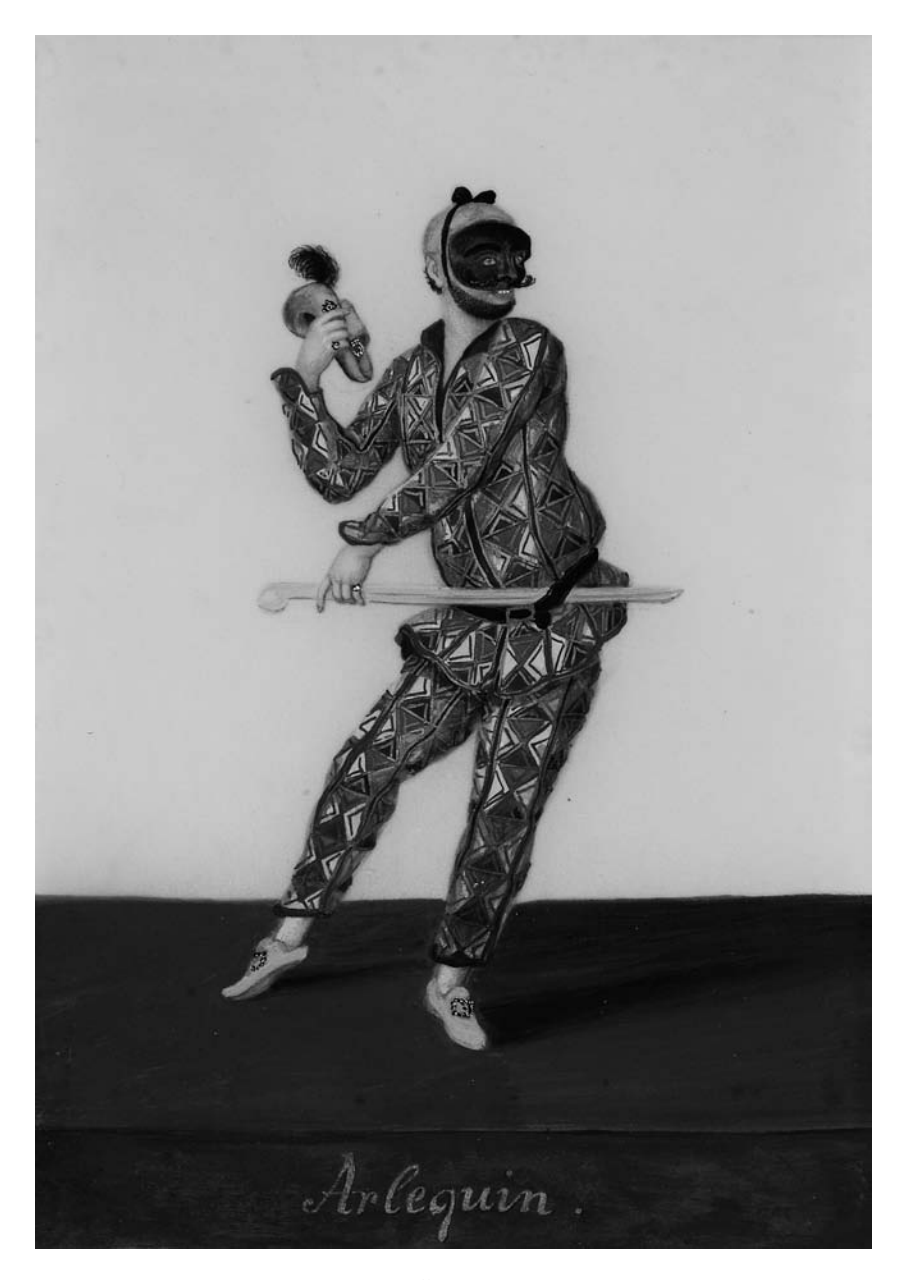
Fig. 6. Arlequin (Collezione del Castello di Český Krumlov).