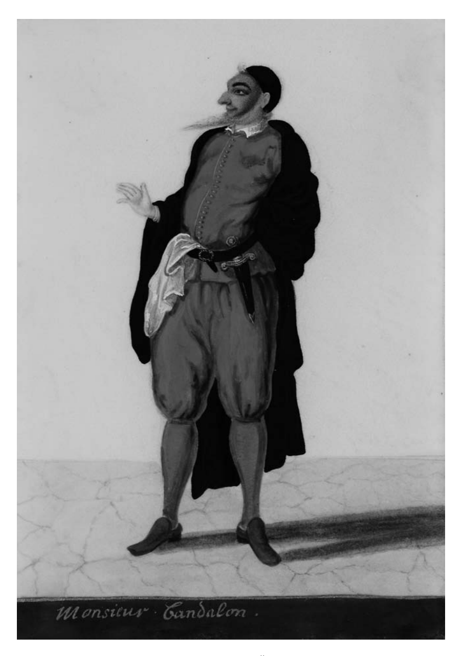
Fig. 4. Monsieur Pantalon (Collezione del Castello di Český Krumlov).