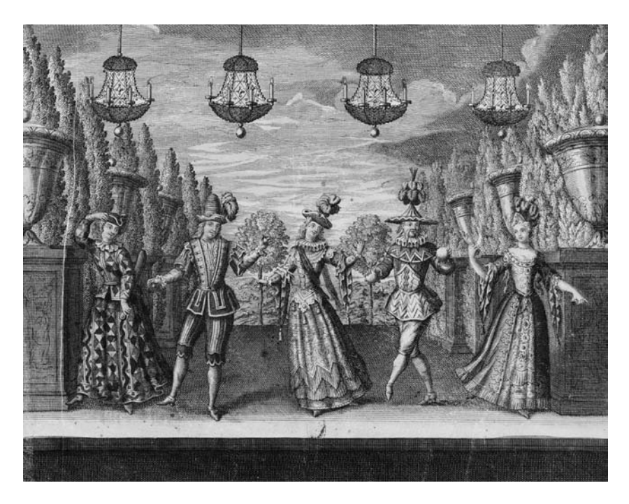
Fig. 2. L'Opéra.