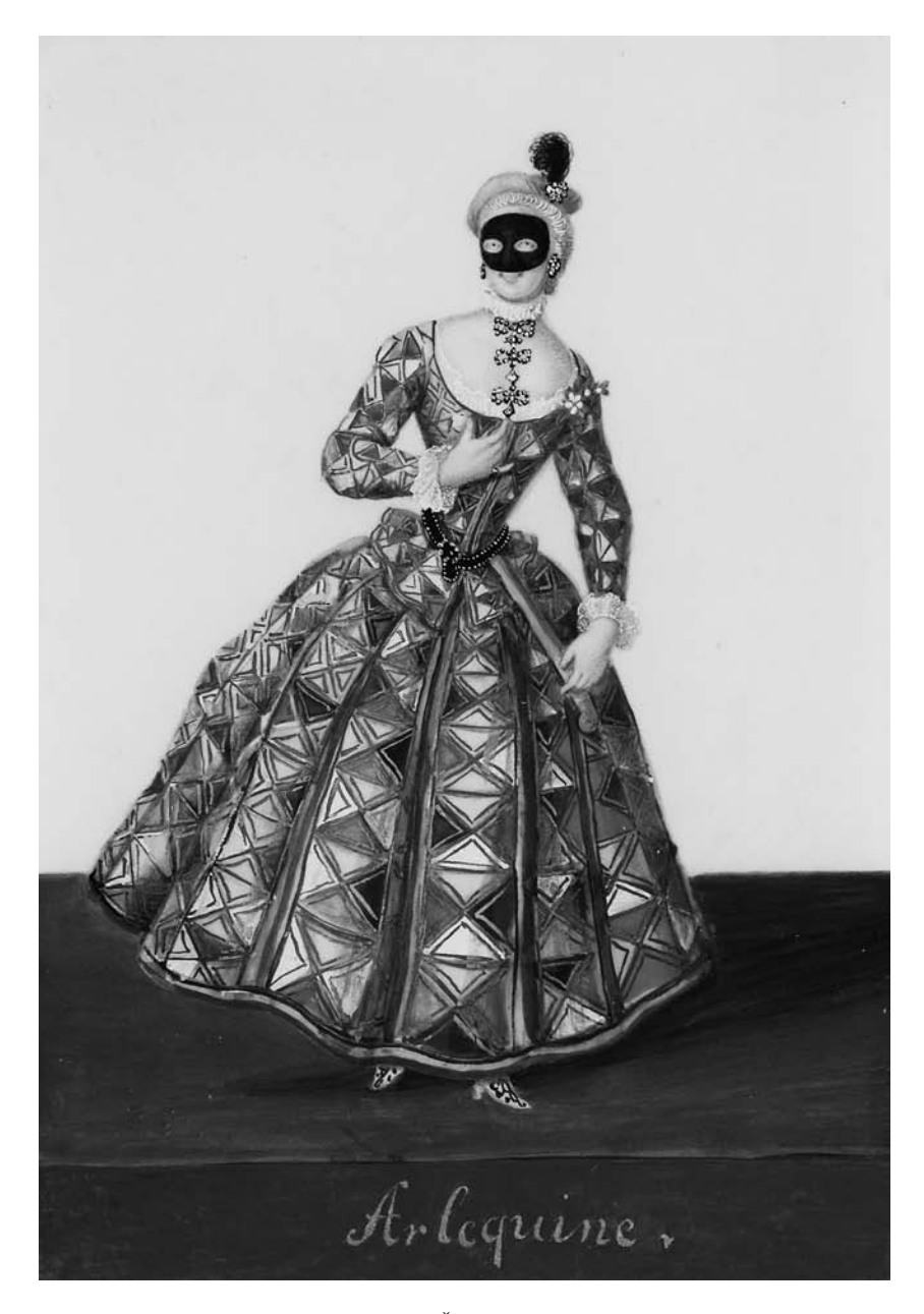
Fig. 7. Arlequine (Collezione del Castello di Český Krumlov).