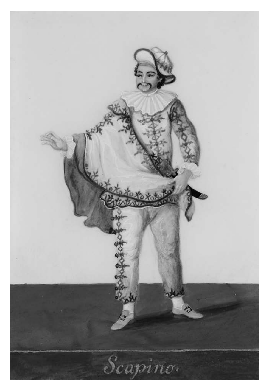
Fig. 8. Scapino (Collezione del Castello di Český Krumlov).